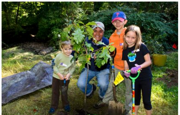
Clockwise: CRC watersheds cleanup, National Public Lands Day volunteers x2, MFPS students label plantings