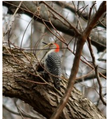
Photos clockwise: Silver birch, Clifford Butler Lewis at old waterfall, Red-bellied woodpecker, Damselfly, Bloodroot.