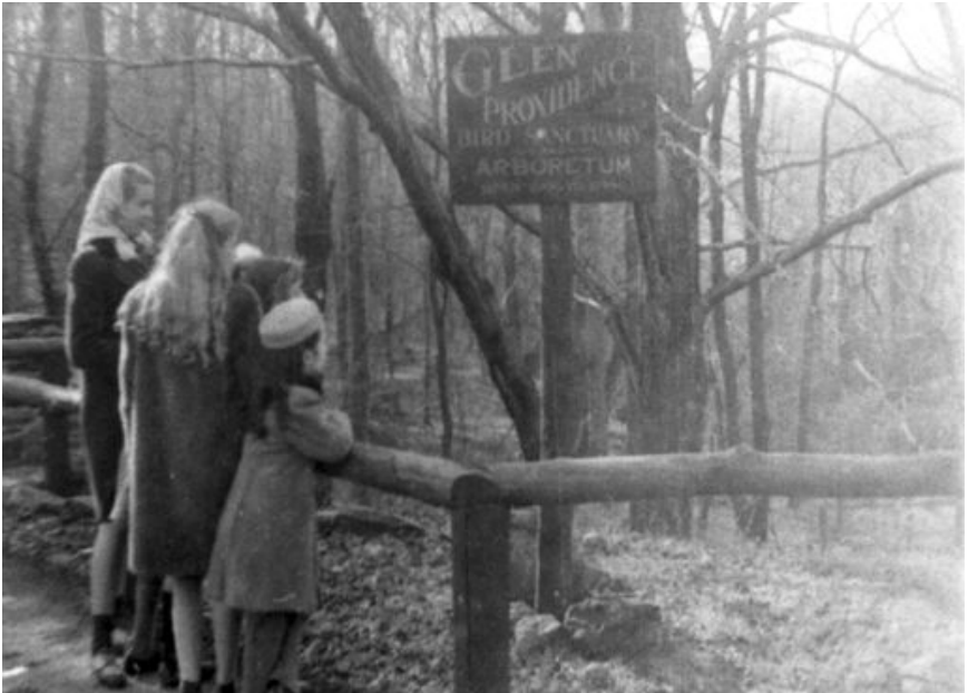
1939 photo of entrance at 3rd and West Streets