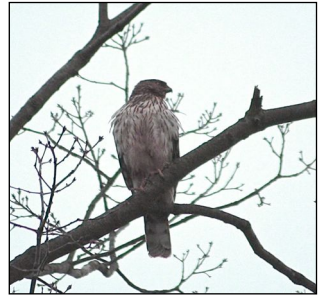
Photos L-R: Naturalist Walk and Talk, Red-shouldered hawk.