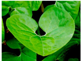
Photos: left, 1.1 acre in winter, spring + summer; right from top: Deer at edge of wetlands, Wood frog, Wild ginger.