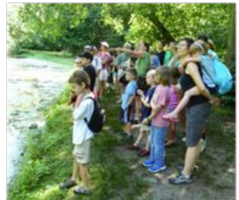
Clockwise: Bird Walk, Great Blue Heron, Pond Walk for Kids, Red Fox, 1940s postcard, 1840's map.