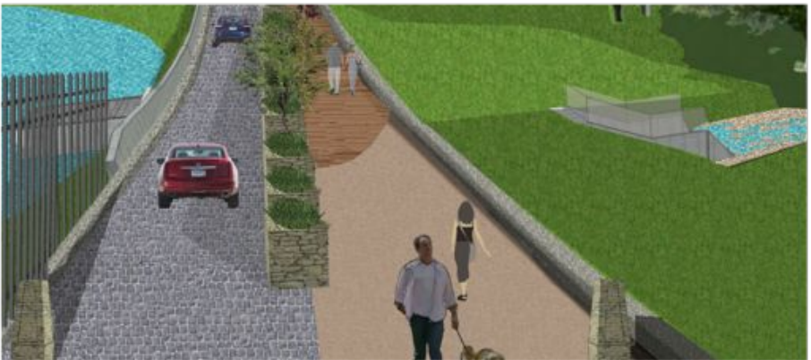
Top: Dam Safety Tour with PADEP's Richard Reisinger; Bottom: Vision for 3rd Street.