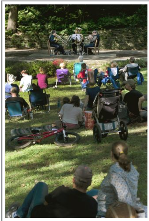
September 2012 Free Concert with Philadelphia Brass

Please keep the enclosed calendar of upcoming events, visit our website, and enjoy the park!