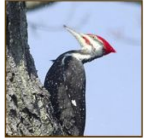
Above: Original footbridge, Pond Walk for Kids, Pileated Woodpecker. Below: Dedication plaque.